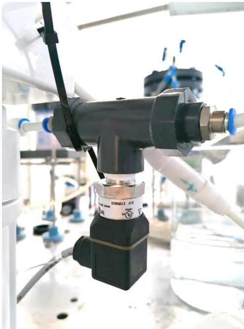
Figure 3: PS4 pressure gauge in the nanofiltration unit.