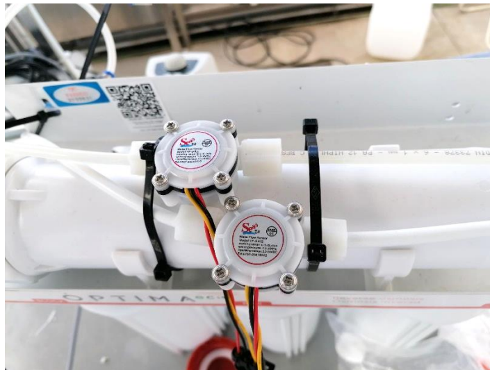
Figure 4: Flow meters in the concentrate and permeate flow.

The robustness of some of the installed sensors did not have that the plant required, so due to corrosion and overheating, some sensors failed after a few months, causing the plant to be without the automation system while waiting to be installed.