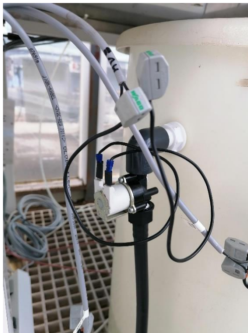
Figure 2: MV8 Solenoid valve installed in the feed tank.

Some of these elements installed in the treatment plant are shown below. In Figure 2: MV8, solenoid valve installed in the feed tank to the treatment plant, Figure 3: flow meters FS6 and FS10 installed in the concentrate and permeate stream respectively and in Figure 4: pressure gauge located at the entrance to the membrane of the nanofiltration system.